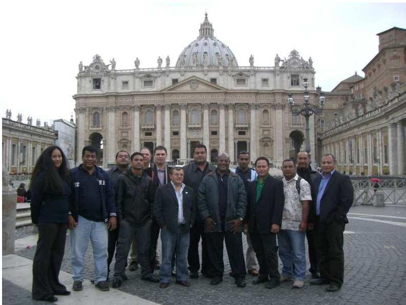
Pacific Officials visiting St Peter's Cathedral in Rome