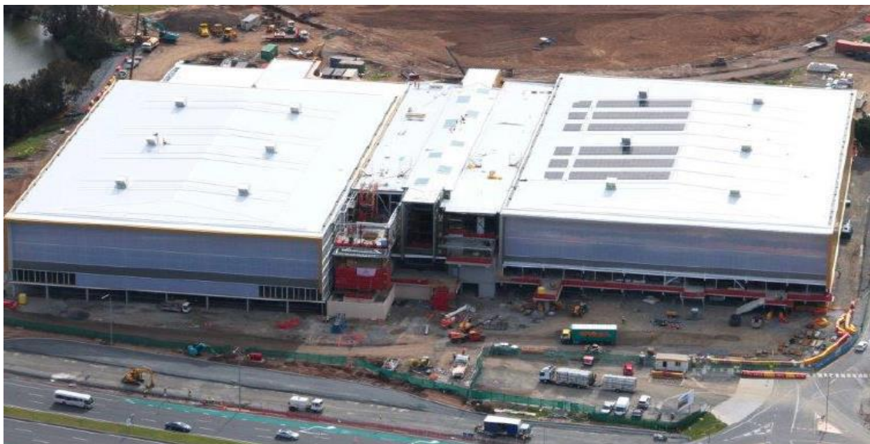
Carrara Sport & Leisure Centre – the venue for the 2018 Commonwealth Games - Weightlifting

The Championships and training will be held at the Carrara Sport & Leisure Centre (CSL) Hall 1. This will also be the weightlifting competition venue for the GC2018 Commonwealth Games. 20 platforms will be available at the training venue.