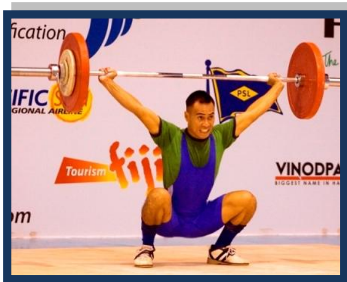
Lapua Lapua – Tuvalu 62Kg category